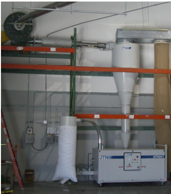
KP with Cyclone Receiver