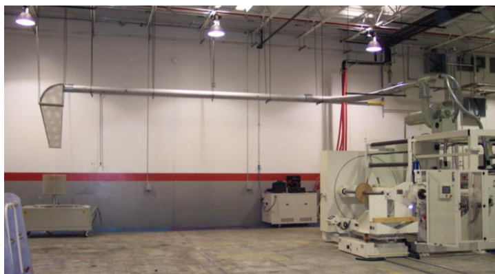
Optional In-Line Air Evacuator