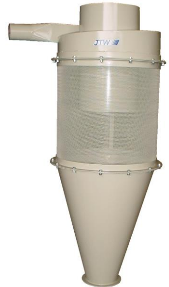
Cyclone Receivers for Small Particles and Fluff