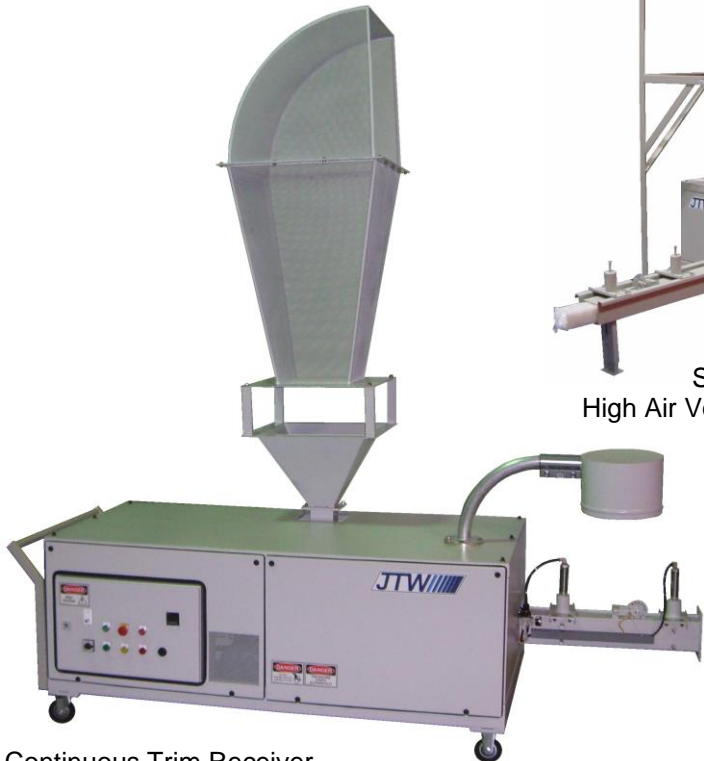
Continuous Trim Receiver shown directly mounted to Poly Compactor