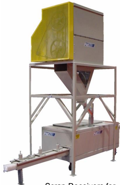
Scrap Receivers for High Air Volume Applications